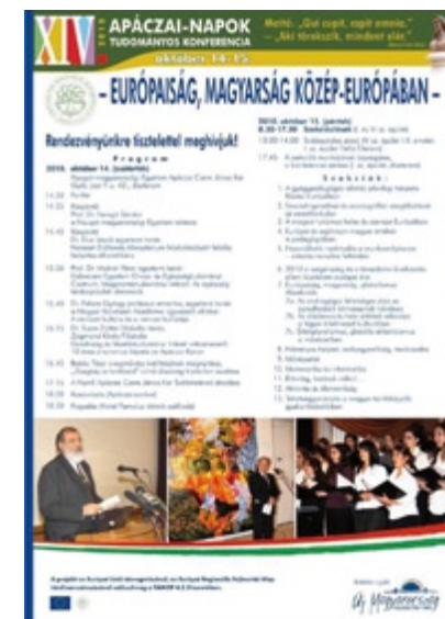
Poster of the scientific conference „Hungarians in Central Europe