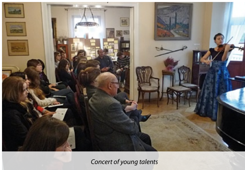
Concert of young talents

The Salon hosts numerous meetings with representatives of the cultural and scientific spheres of Poznań and the Wielkopolska province, and also meetings with guests invited by local authorities, such as members of parliament, steering committees of scientific conferences and symposia, and participants in international cultural projects and exchange programs.