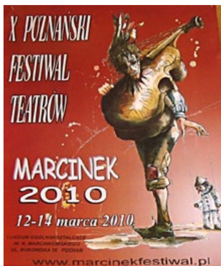
Poster of the Xth Theater festival „Marcinek” in Poznań 2010