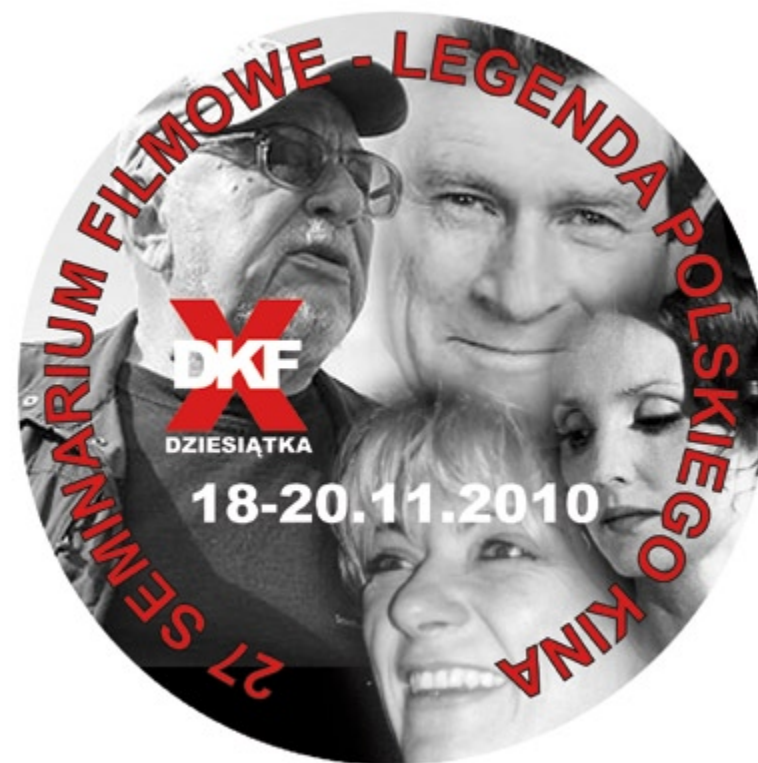
A special pin of the XXVIIth Film seminar

are not simple. It is not a minor issue. It is difficult, because it is necessary to connect the speaker to the audience (...) You can speak beautifully, but if you are not able to make the audience involved and interested in the topic, your communication can not succeed" 28 .