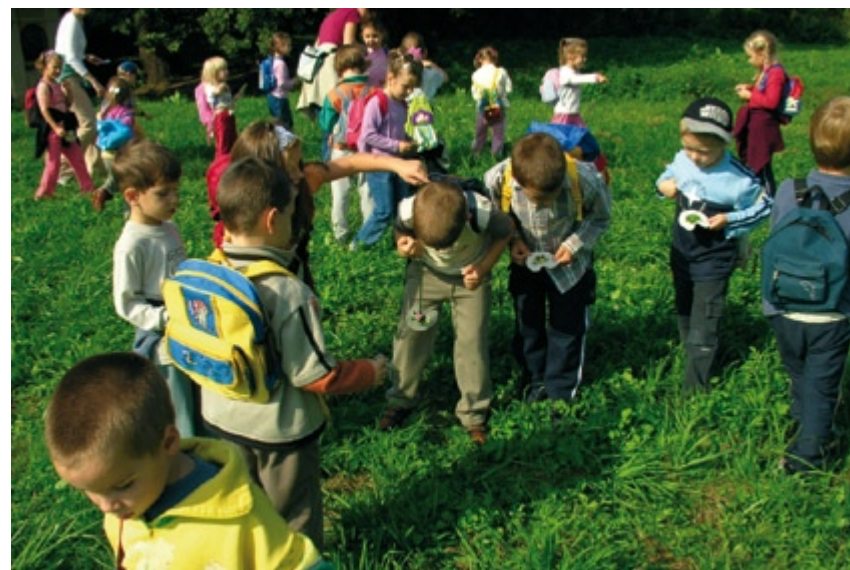
Lecture in the Forest school in Ravazd

modeled in pedagogical practice as a 'guide book' 31 . Forest pedagogy is the unity of theory and practice, while being in its second decade of functioning in the Forest School Education Centre at the Ravazd Forestry ensures its research and modelling value in school development.