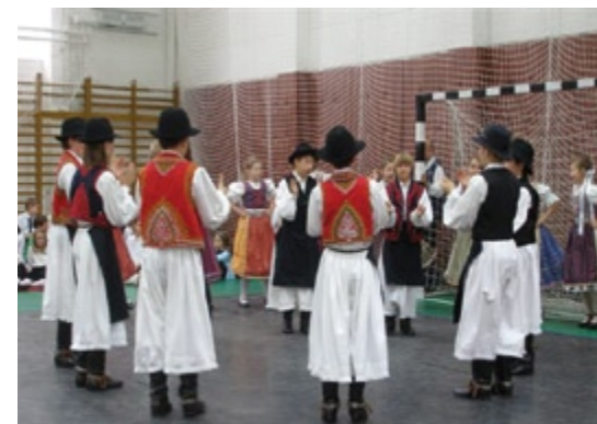
Final gala event of „School week” organised in the Primary School in Győr

As our school is dedicated to developing talented children, it offers pupils 20 different study circles to choose from. Some of them are related to