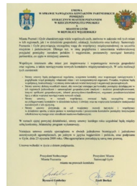
Copy of the agreement between Győr and Poznań, signed by the Mayor of Poznań and the Mayor of Győr.

The willingness to strengthen and deepen the long-lasting friendship between the Polish and Hungarian nations was fruitful, and on 23 January 2008 the authorities of Poznań and Győr signed an agreement to establish “partner city” relations.