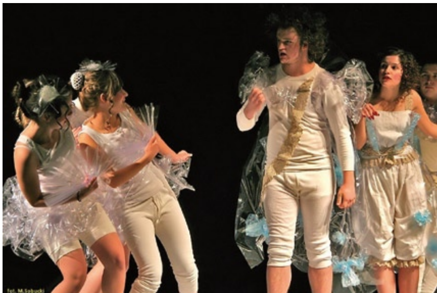
Theater Nadir from the High School no.1 in Poznan during the Play „Ivona, the Princess of Burgundy”

- actors and audience - can participate in workshops and lectures related to theatre. Both workshops and lectures are organized by professional experts such as actors from the Polish Dance Theatre in Poznań, Poznań Ballet, and by lecturers of Adam Mickiewicz University in Poznań.