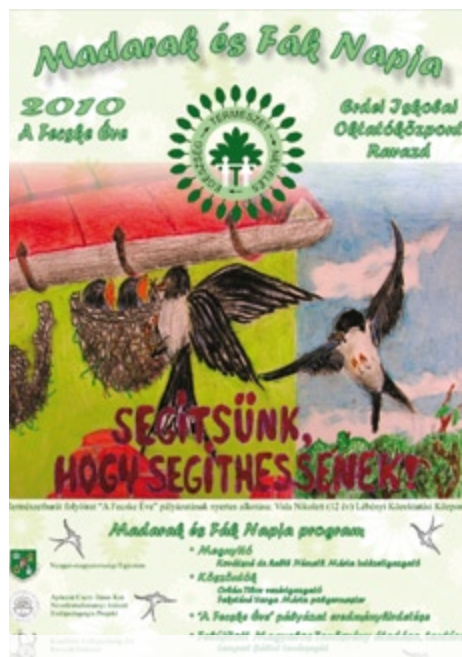
Posters from the forest school in Ravasz