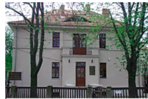
„Villa among the roses” Nowowiejski Music Salon

arrangement was recreated, and later on furniture, instruments and decorations were also put in their original places. At the same time a permanent Nowowiejski exposition was created with his family photos, autographs, writings, letters and documents. There are also temporary expositions like "Master Nowowiejski and his choirs", which was organized for the 80 th anniversary of PeWuKi (Universal National Exposition – the Poznań Fairs) in 2009, or the expositions "With our ancestors for our honour, with brothers for our comfort – 100 years of Feliks Nowowiejski's Rota" in 2010 and "The Inspiration of St Maria for Feliks Nowowiejski" in 2011.