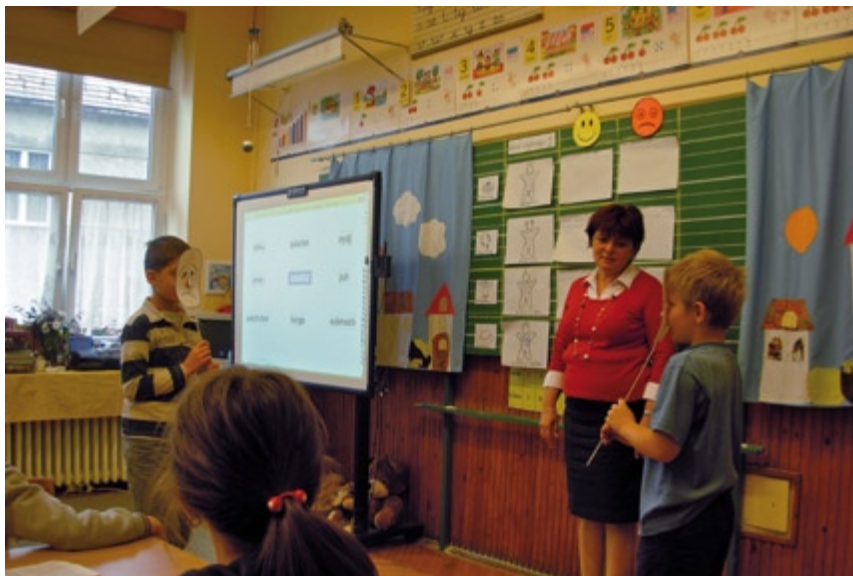
Drama pedagogy during the lecture in Kálmán Öveges Primary School