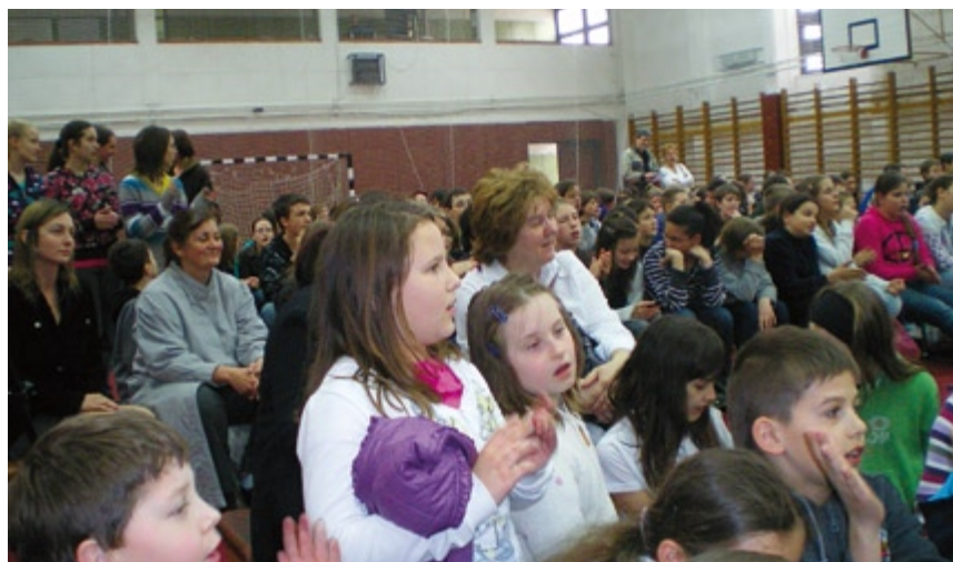
Final gala event of „School week” organised in the Primary School in Győr

“...during the eight years of our educational work we prepare our pupils to acquire basic knowledge, and we strive to develop each student according to their needs, skills and talents. Our developmental work should be embedded in a positive, helpful, pupil-centred pedagogical attitude. This work can contribute to the recognition of our talented children and make their skills flourish if we take care of all the elements of the individuals’ different personalities. The basic element of this activity is to prepare highly detailed, thoroughly analyzed and consciously applied pedagogical work that is