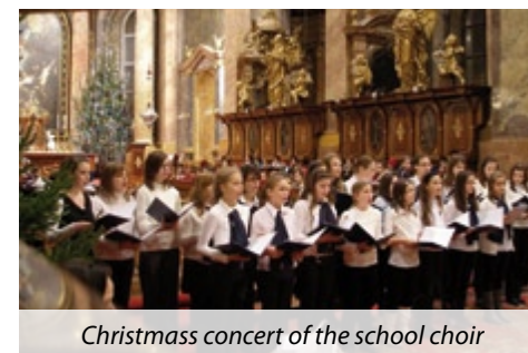
Christmass concert of the school choir

The overall task of education is to prepare the next generation to find its way and to ensure cultural continuity. Besides this, our aim is to give the maximum possibility for pleasure while learning. This was the main aim of the program. The main profile of our department is to educate our students in music and music pedagogy. The main tasks are music teaching, pedagogy, music history, folk music, music therapy and the supervision of the student's practical education. Our department is represented in new faculties' educational programs (in the social pedagogy faculty we teach music therapy, and in the department of special needs education we teach general music education and development). Our task is to educate music faculty students. Besides music education, our goal is to shape the college's musical life, to start art activity clubs and to give a chance to our colleagues and students to give performances. We regularly take part with our students in different festivals (folk singing competitions,