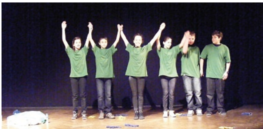
Theater group from Győr during the theater festival „Marcinek”

for children. These visits give them the chance to get familiar with the local theatre as well as performances in Budapest. All these experiences enrich the children's personalities and maintain their interest in drama and theatre.