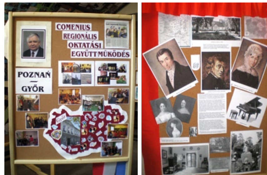
A special poster on the Comenius Project - prepared in Kálmán Öveges primary school