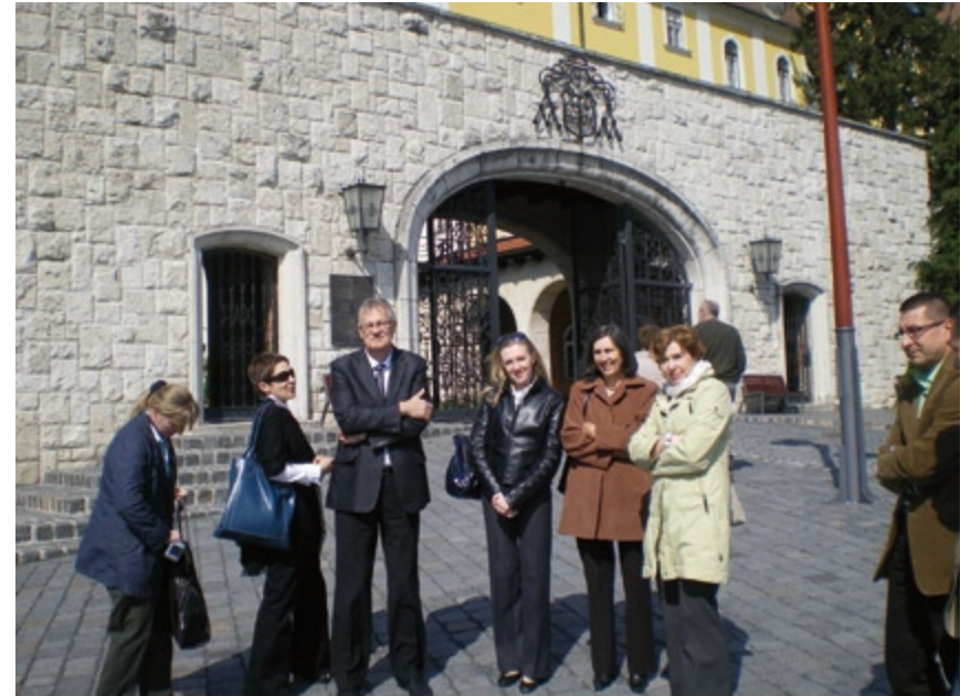
Some moments of our cooperation