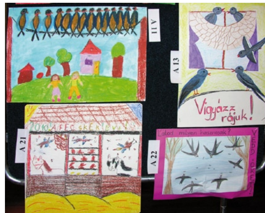
Exhibitions of childrens work from the forest school in Ravasz

The folk crafts sub-project is about the job of the carpenters, woodcarvers and potters, who are lead by the masters of the crafts in the forest school. Pupils directly experience the physical characteristics and formation techniques of natural materials like wood, clay and wool. They can try their handiness, strength and patience while making their own creations before the master's eyes. These activities are great adventures for the pupils, because we often see that they have a limited number or no such activities at all in